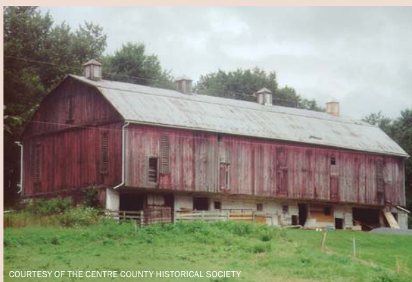
Townships are required by several state laws to provide for the preservation of historic areas and structures, such as the 125-year-old Lutz-Franklin schoolhouse in Lower Saucon Township, Northampton County (above), and this historic barn in Gregg Township, Centre County (left).

Historic preservation considerations should play a central role in any comprehensive plan that seeks to maintain the unique character of a community while accommodating growth and change .