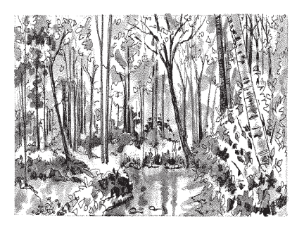
How Wide Should A Buffer Be?

Field Studies have shown that the water quality benefits of riparian buffers increase as buffer widths increase.