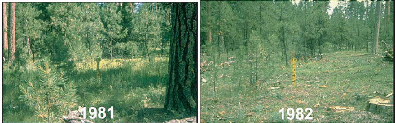
Before and after photographs showing the effects of logging (Hall 2002)