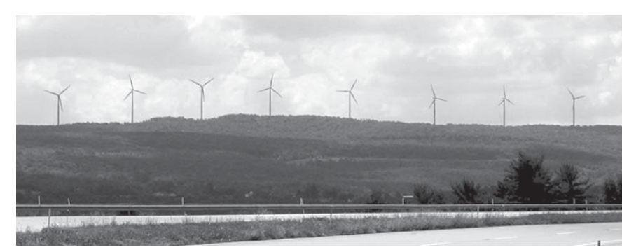
A Manual for Townships