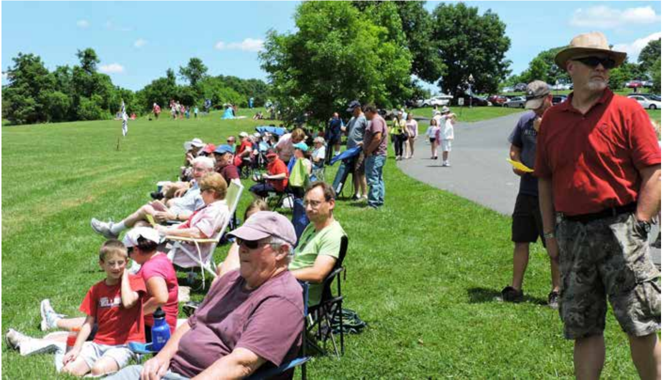
Visitors throng meadows to watch an old-time baseball game at Pennypacker Mills Historic Site.

Concentrate on open space acquisitions that relate strongly to Montgomery County's network of county-owned or managed parks, trails, historic sites, natural areas, and the Schuylkill River.