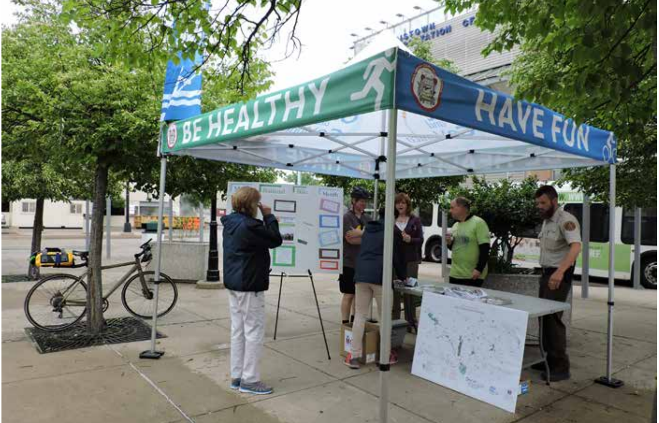
Montgomery County's "Get Out and Go" tent draws visitors at many outdoor events.

Allocate necessary funding and staff to promote the Get Out and Go Montco initiative on an ongoing basis; involve multiple county departments, boards, and other volunteers in sharing the Get Out and Go message.