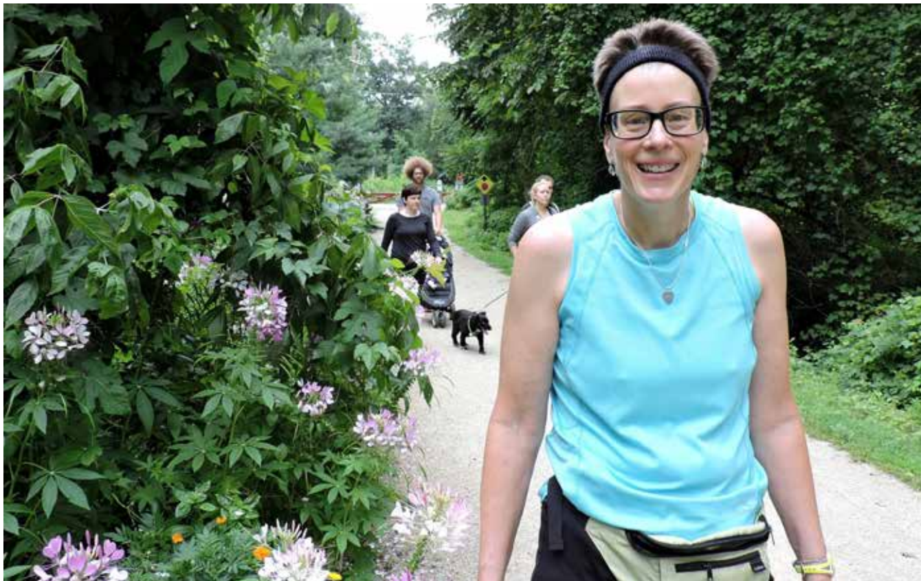
Visitors enjoy the Pennypack Trail in the Lorimer Park Area.

Continue to implement the county's primary trail network by building on the sections already in place.