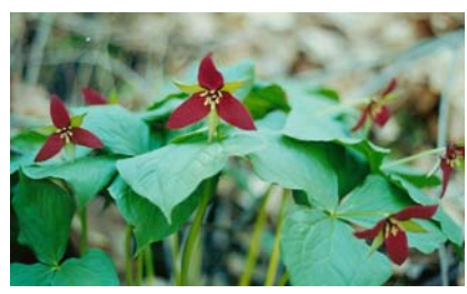
Indian Pipe, Virginia Bluebells, Trout Lily, and Red Trilliums are just some of the many native plants found in Duff Park.

Over the years, Duff Park has drawn the people of Murrysville together – first to acquire it, then to develop it, catalogue and document its many resources, enjoy it, and when necessary protect it. Shortly after it was acquired, the park was vigorously defended by many in the community against the prospect of its loss to a rerouting of SR22. Subsequent threats to the park's natural preservation have included consideration of logging, construction of gas lines, and the intrusion of invasive plants.