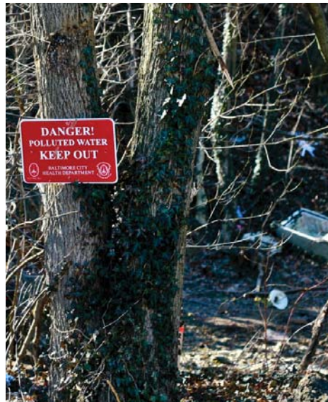
This polluted stretch of the Gwynns Falls is off-limits to the public. Gwynns Falls drains to the Patapsco River from an watershed in southwest Baltimore and portions of Baltimore County.