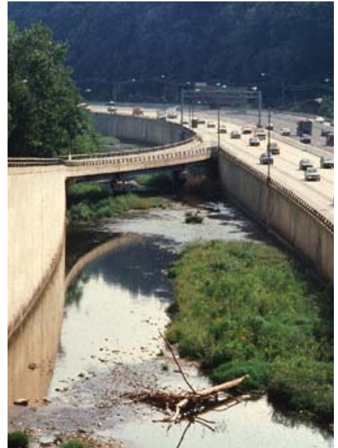
The Jones Falls drains from a 40-square-mile watershed that covers parts of central Baltimore and a more suburban area to the north in Baltimore County. Much of the river within the city has been diverted underground or obscured by the Jones Falls Expressway,

The committee set parameters that would define them for one-year only. They agreed to hold the Herring Run Watershed Center