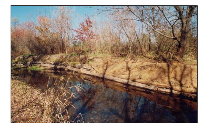
Macoby Creek, which runs through the park, suffered from steep eroding banks

The Committee requested the expertise of Munro Ecological Services, Inc. (MES) to provide inventory and concept planning with the intent that the Committee would search for grant funding to do the planned work. Some of the concerns of the Committee were that the stream in the park was badly eroded, there was too much grass to mow, the park wasn't "natural" and it lacked decent riparian vegetation and floodplain forest. The Committee agreed with the consultant that ecological restoration was needed.