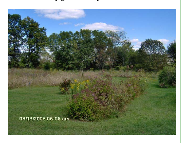
Warm season grass meadow and native flower plantings

The first growing season was mostly in drought condition, but during several Earth Day events in following years, in which local volunteers planted Borough-purchased seed and grass plugs, the meadow finally grew thickly and tall.