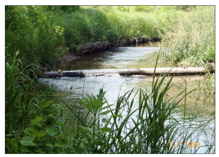
A stream sill and planted structural fascines

The plantings in most of the bio-structures grew rapidly and have begun to perform their long-term rooting and erosion control function. The few places where initial plantings in the interstices of the log structures did not grow, are gradually being replanted during yearly Earth Day events. The Macoby Creek is now stable through the Nature Preserve. Only a few areas are in need of small structure repairs.