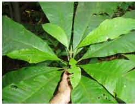
Umbrella Magnolia G5, S2 FT ( Magnolia tripetala )