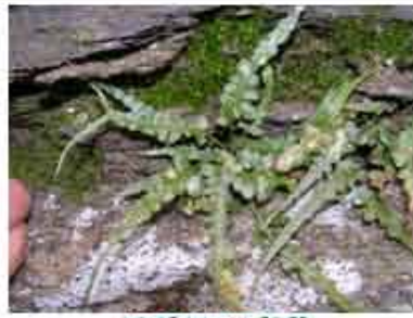
Lobe Spotted Fern S3 ( Asplenium pinatifidum )