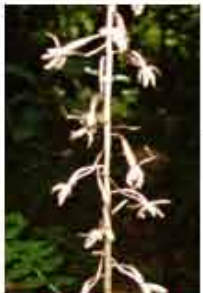
Ghost Orchid G4G5, S3 PR ( Waviliana discolor )