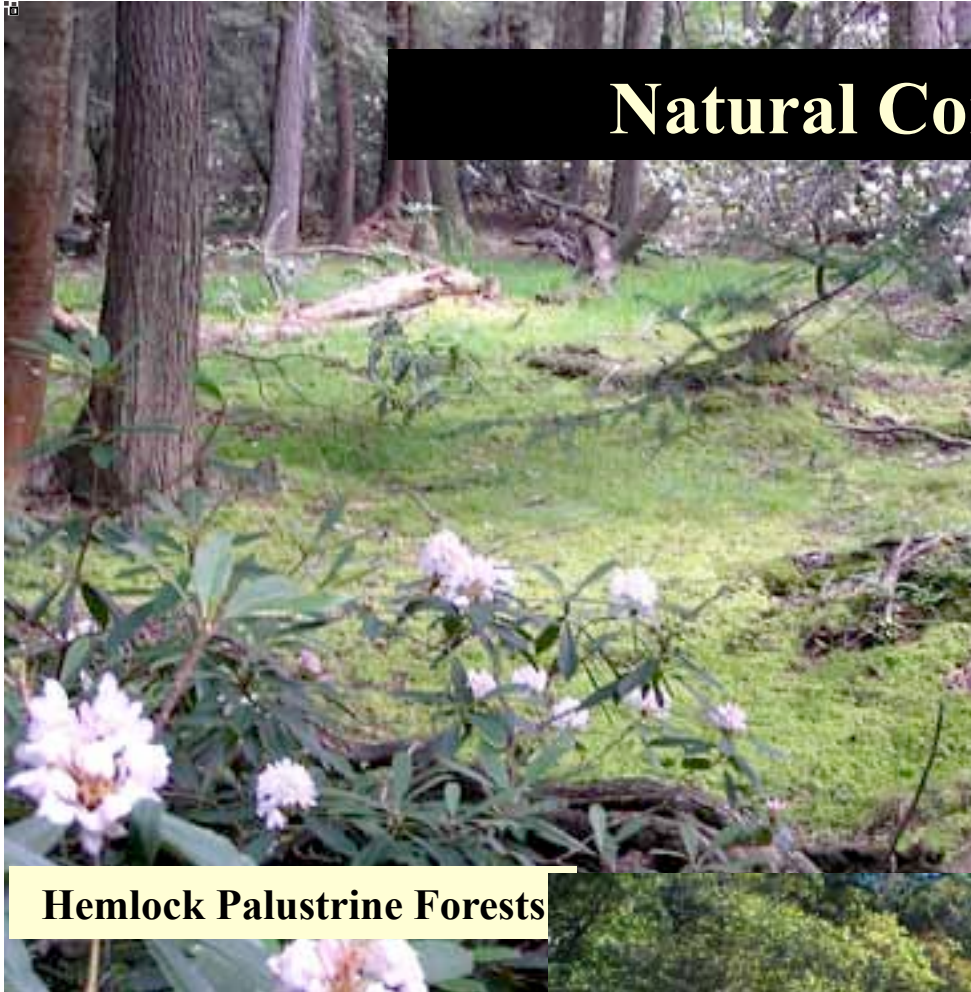
Hemlock Palustrine Forests