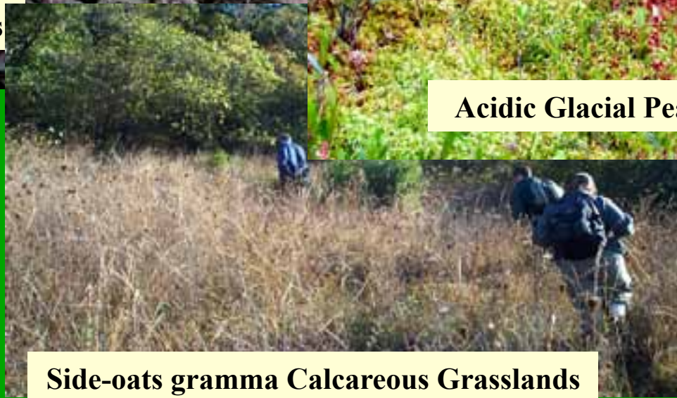
Side-oats gramma Calcareous Grasslands