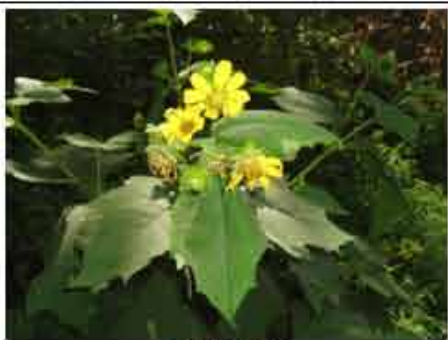
Leafcup G4G5, S1R ( Polium nudicaule )