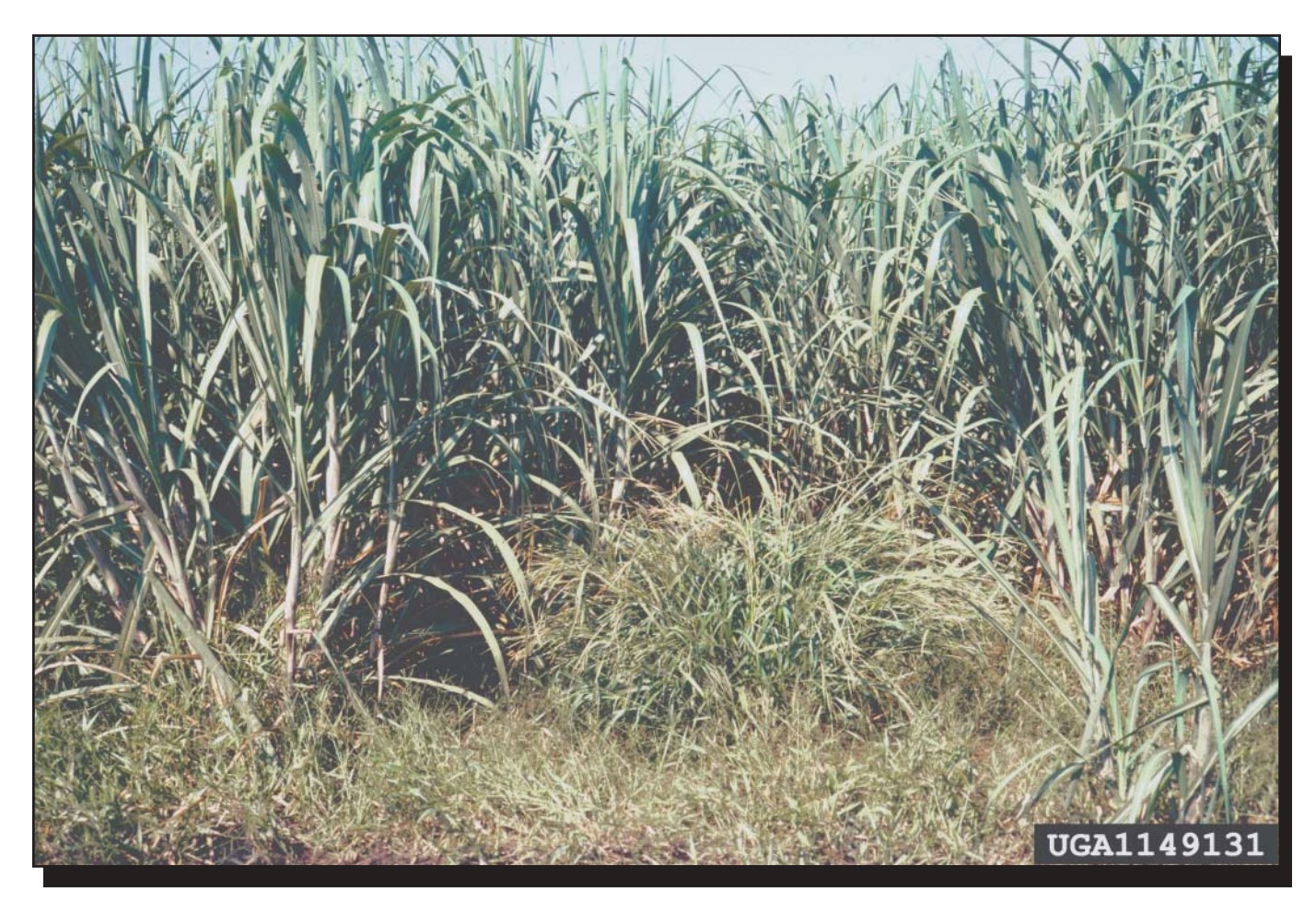
Itchgrass was introduced to Florida from the Philippines in the 1920s as a pasture grass. The tall, aggressive grass has infested roadsides throughout the southeastern United States, displacing native plants.

(7) Evaluate and prioritize noxious weeds along existing Forest Service access roads leading to project area and treat as indicated by local analysis and prescriptions, before construction equipment moves into project area. New road construction must be revegetated as described in Weed Prevention measure see section (3) (a), (b), (c) above.