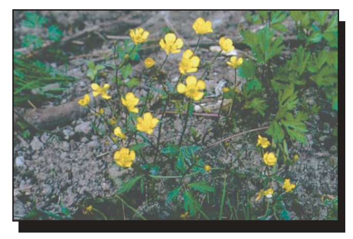
Figure 5—This attractive little creeping buttercup has established itself in gravelly soil similar to a roadway shoulder.

The incredibly large quantities of seed produced by weed species can produce extremely high plant densities. Scotch broom was found to produce over 16,000 seeds per square meter in a study in Australia (Smith and Harlen 1991). Yellow star thistle (figure 6) has been recorded at densities of 2 to 3 million plants per acre (Callihan and others 1989) with possible seed production of 24,000 achenes (one-seeded fruits) per square yard (Maddox, Mayfield, and Porits 1985).