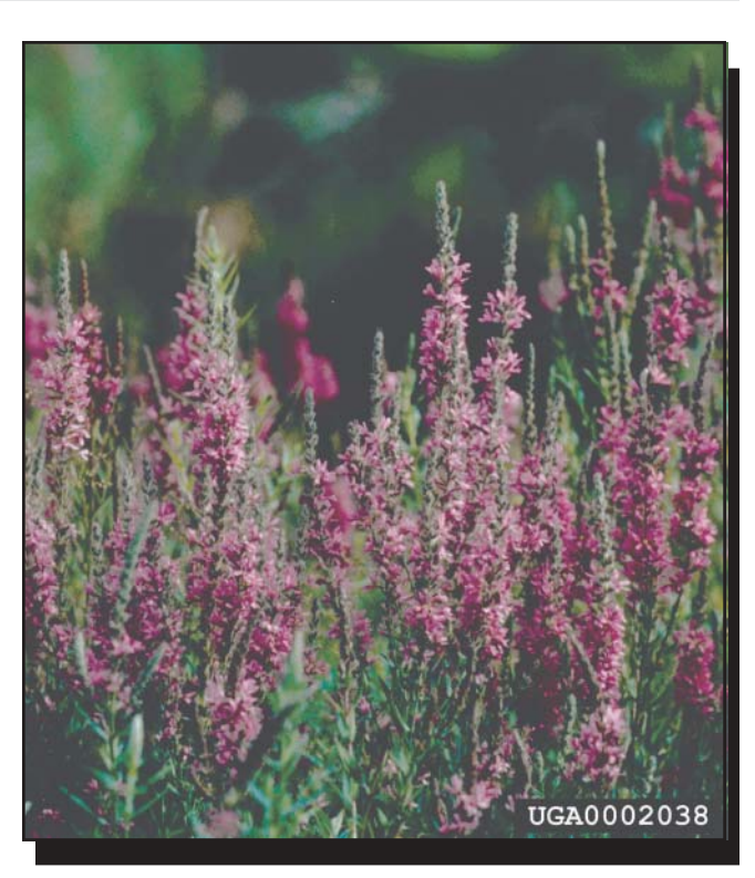
Figure 7—Purple loosestrife has an attractive flower, but it can take over an area, creating a loosestrife monoculture and completely replacing native species.

Establishing and maintaining competitive, desirable plants along roadsides and other areas vulnerable to weed colonization helps prevent or slow establishment, growth, and reproduction of noxious weeds (Sheley and Petroff 1999). A study in western Montana determined site factors influencing weed establishment and spread on roadsides. Results showed that shading of the roadway by tree and shrub overstory was a primary factor limiting spotted knapweed establishment on roadsides in forest habitats (Losensky 1989).