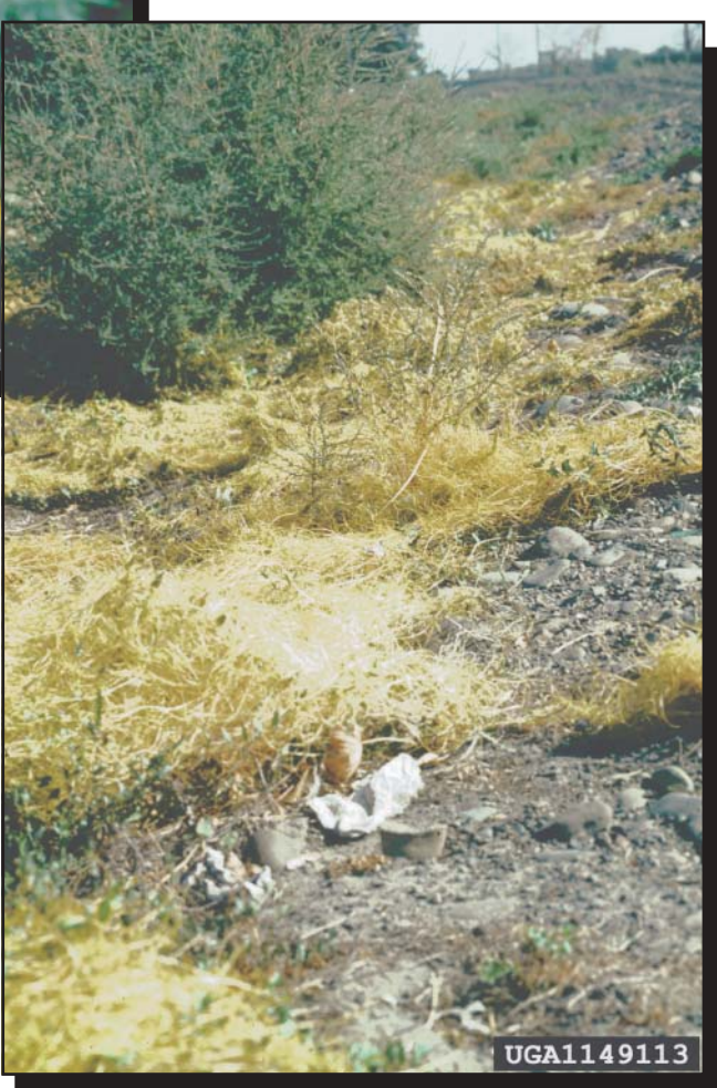
Dodder is a parasitic vine that is fed from host plants. It looks like a bright yellow thread among plant stems and leaves.