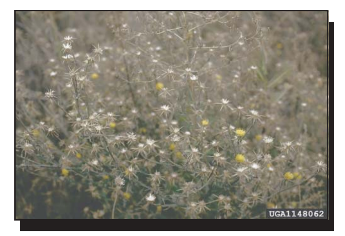
Figure 6—The spines on the seed heads of this yellow star thistle show how it received its common name.