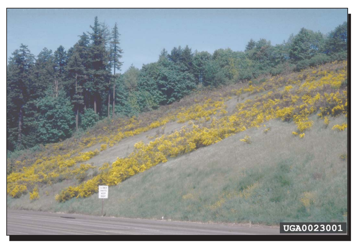
Figure 4—The ancestors of the scotch broom plants that infect this hillside in Oregon were brought to the United States as an ornamental garden plant.