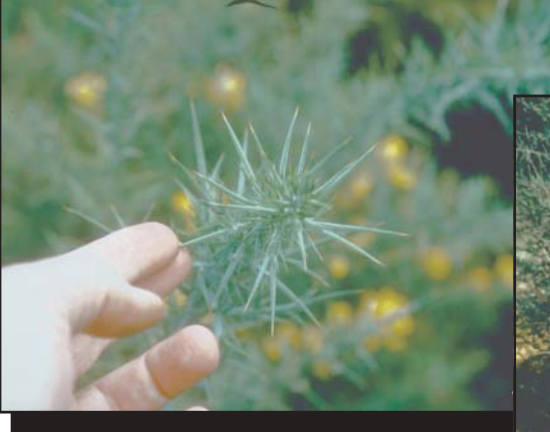
Common gorse is an imported shrub with lovely yellow flowers and impressive thorns that displaces native shrubs and disrupts natural habitat. It is particularly aggressive in coastal scrubland environments.

Consider developing grader-mounted technology for "last pass" seeding of desirable grasses along road shoulders. A grader-mounted seeding mechanism would reduce seeding costs and make reseeding more practical, given limited maintenance budgets.