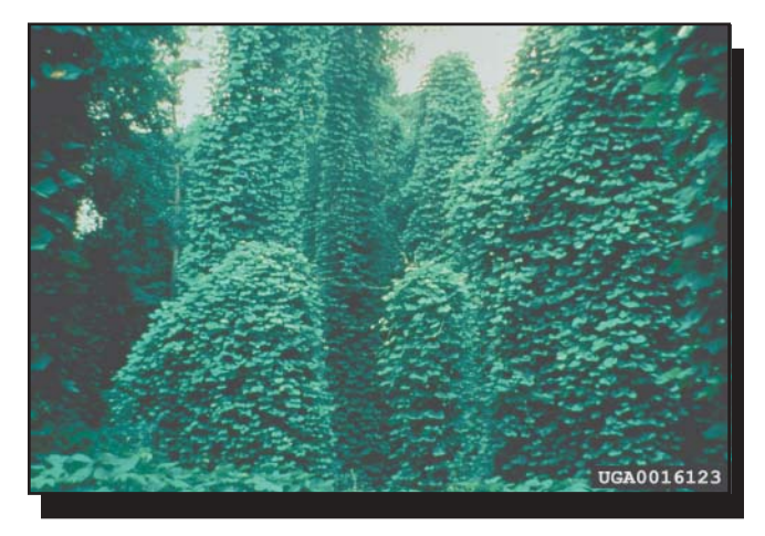
Figure 8—This established kudzu infestation mimics the foliage on the trees it killed and whose trunks it now uses for support.