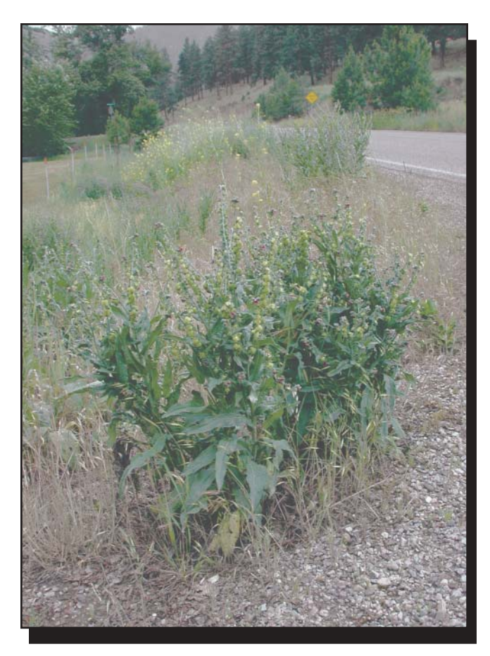
Houndstongue—sometimes called gypsy flower—is a drought-resistant weed introduced from Europe in the early 1800s in contaminated crop seed. It prefers open, disturbed ground, such as that created by road construction and maintenance.

The National Roadside Vegetation Management Association ( http://nrvma.org/index.html ) is a network of Federal, State, county, city, university and industry personnel dedicated to providing expertise, solutions and networking opportunities to personnel involved in integrated roadside vegetation management and in providing safe, beautiful roadsides.