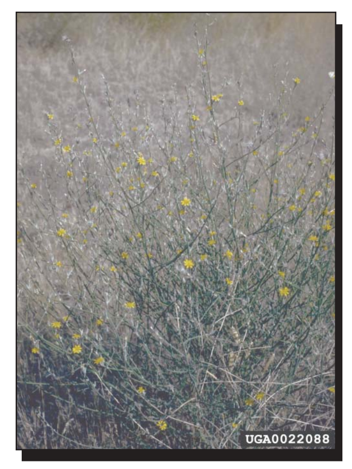
Figure 2—Rush skeletonweed plants have invaded this dry grassland, replacing beneficial forage species grazed by livestock and wildlife.

years (Toole and Brown 1946). Studies of Scotch broom (figure 4) have shown that 0.6 percent of seed in dry storage were still viable after 81 years, and that Scotch broom seed may remain viable in soil for as long as 100 years (Turner 1934). Viability of yellow star thistle seed declines rapidly, but 20 to 40 percent are viable after 1 year and 10 percent can remain viable for longer than 10 years (Callihan, and others 1989).