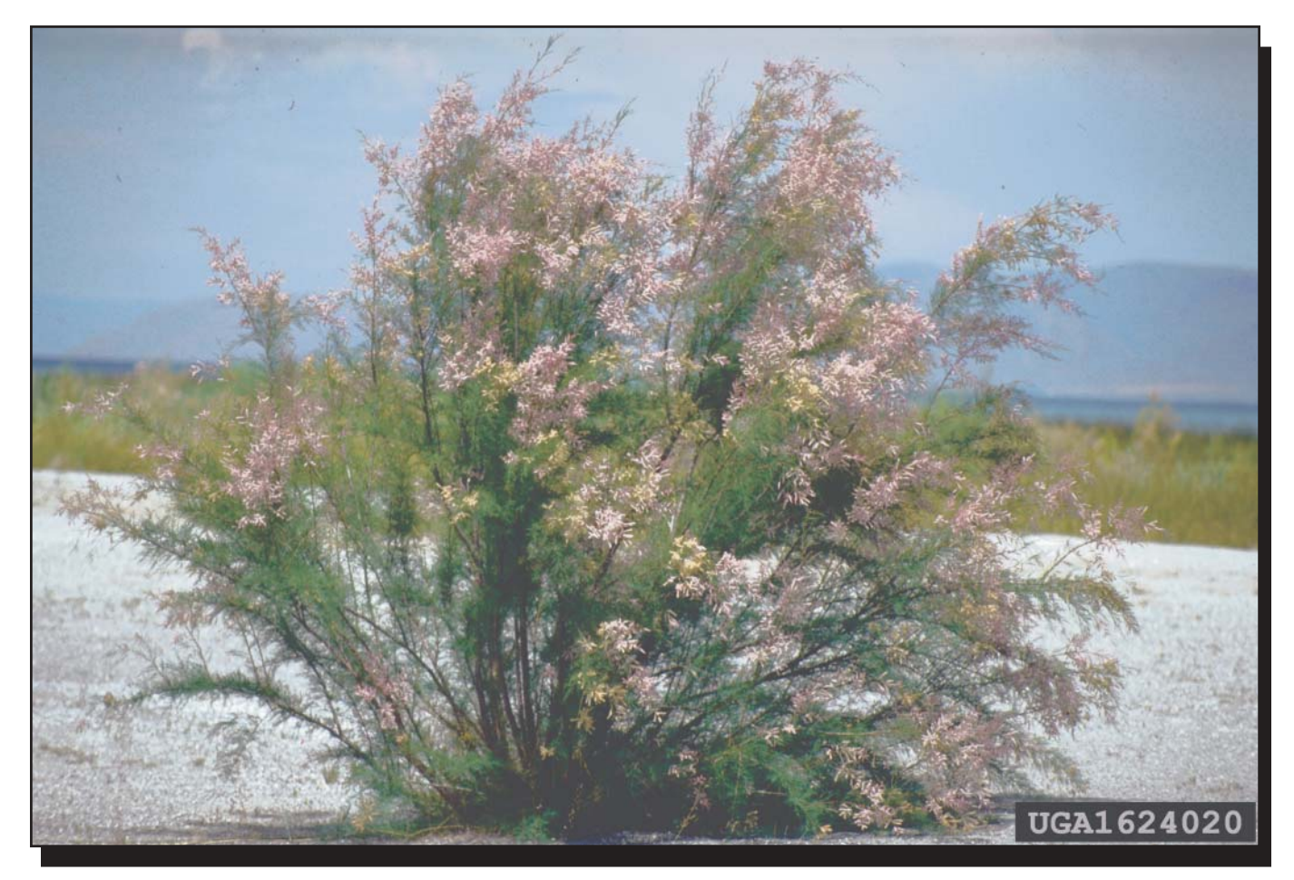
Introduced as an ornamental from Asia, saltcedar invades riparian habitats throughout the American West. It releases salt into the soil, making the soil unsuitable for native species.

Linear roadside weed infestations are similar to long, thin wildland fires and should be controlled before they cover large blocks of land.