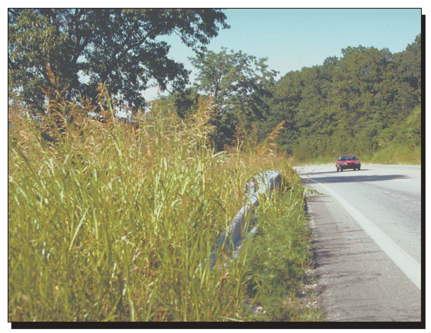
Johnsongrass was introduced into Alabama in the 1830s as a pasture grass from eastern Europe. It has become a roadside safety hazard that obscures visibility and increases the intensity of roadside fires.