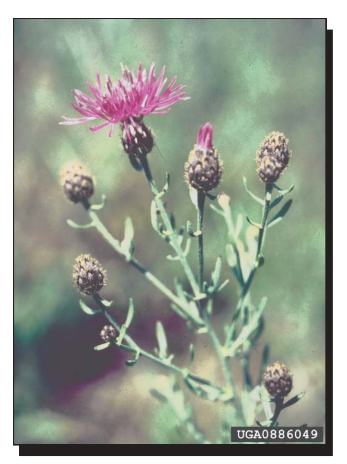
Figure 3—Spotted knapweed has a purple flower that superficially resembles the garden flower, bachelor's button, and several native aster wildflowers.

Hard seed coats and burial in soil may extend seed viability in some species. For example, spotted knapweed seed has a hard outer coating that protects it from being degraded in soil, while burial under as little as a \frac{1}{2} inch of soil "banks" the seed and prevents it from sprouting. Davis and others (1993) found that 29 percent of spotted knapweed seed was still