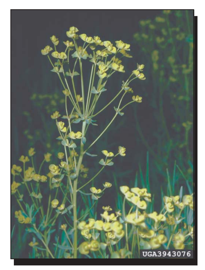
Figure 1—Leafy spurge aggressively displaces native vegetation not only by usurping available water and nutrients, but by releasing toxins that prevent other plants from growing.— Photo by William M. Ciesla. Image 3943076 courtesy of Forestry Images (http://www.forestryimages.org).

Plant biology is an important factor in identifying the road maintenance activities that help weeds become established and spread. Seed of most perennial noxious weeds such as leafy spurge (figure 1), oxeye daisy, rush skeletonweed (figure 2), and spotted knapweed (figure 3) can remain viable longer than 5 years (Liao and others 2000, Davis and others 1993, Wicks and Dersheid 1964, Toole and Brown 1946). For example, 82 percent of buried oxeye daisy seed was viable after 6 years, and 1 percent of the seeds were still viable after 39