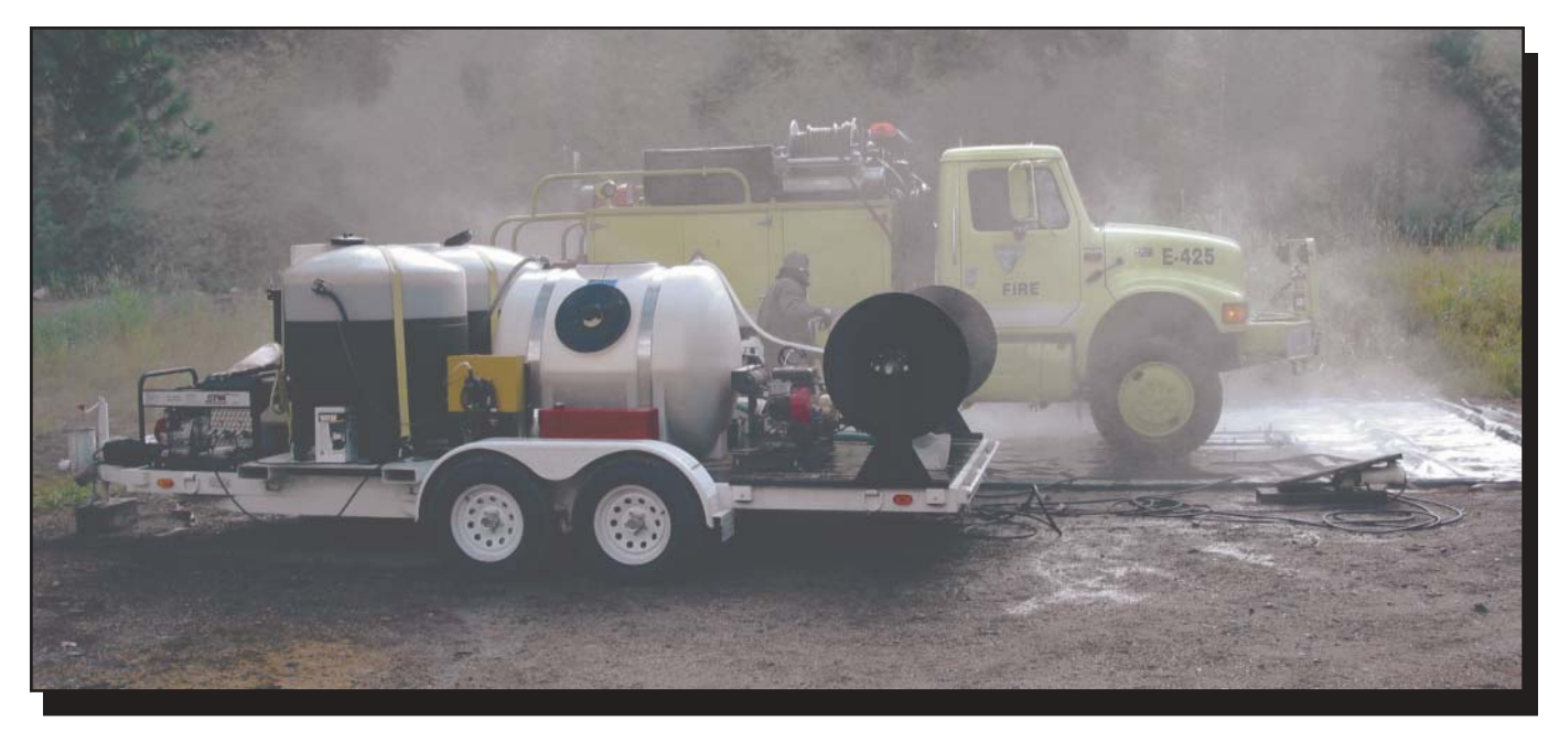
Figure 9—The portable vehicle washer developed by the Missoula Technology and Development Center is being used to clean a fire engine on the Bitterroot National Forest.

The Forest Service Technology and Development program has developed a high-pressure mobile power washer (figure 9) mounted on a trailer that can be towed by a pickup. The